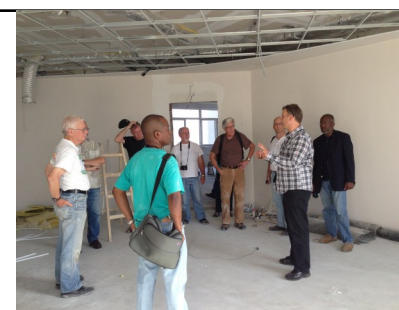
The whole team pose, at work and study