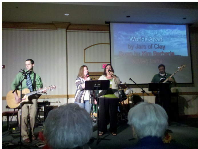
New Life Praise Team, Bellevue NE