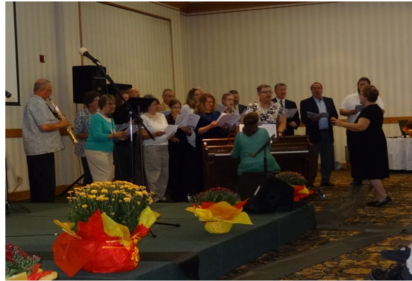
FBC North Platte Choir